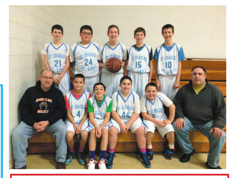
Our CYO Modified Basketball Team

St. Charles Food Pantry... Canned fruits and vegetables, (especially canned pineapple) SOUPS of all kinds, fresh or instant potatoes, jello/puddings, hot cocoa mix, cake mixes, frosting, peanut butter and jelly, pasta, sauce, mayonnaise, cookies, crackers, cereal, mac and cheese, coffee, tea, miniature marshmallows.