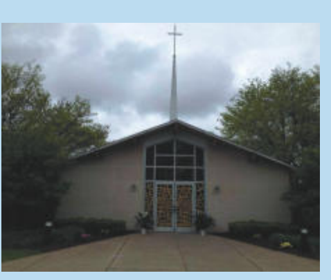
January 27, 2019

St. Charles-St. Ann Catholic Church Welcomes you!