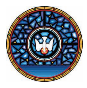
CONNECTED IN CHRIST!