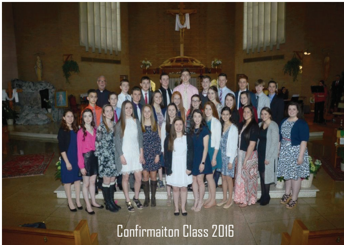
Confirmaiton Class 2016